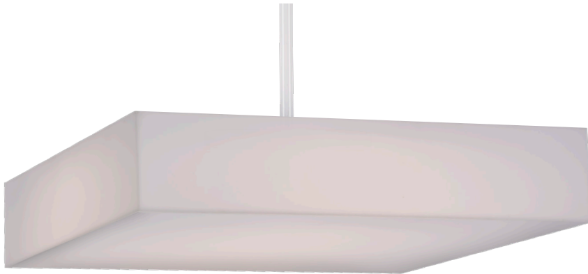
SHOWN AS SUSPENDED