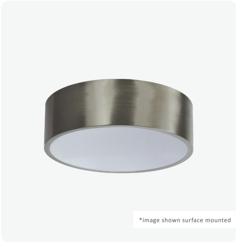
*image shown surface mounted