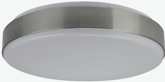
*image shown surface mounted