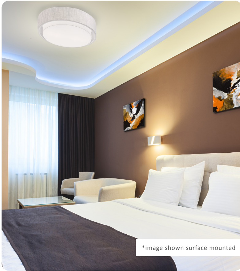
*image shown surface mounted